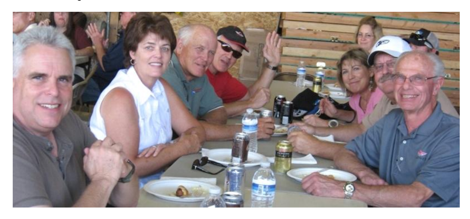
These Mooney people evidently did not miss dinner and they look happy and satisfied

My room was nearby and on the first floor. There was a catered BBQ dinner back at the airport but someone changed the time from 6 PM to 5 PM so we missed it when we drove back.